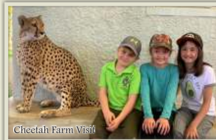
Cheetah Farm Visit

A photographic safari can be an add on to your hunting safari or we can make you, the client, a tailor-made photographic safari . We usually take clients to Etosha National Park through Damaraland to Namibia's spectacular West Coast where the Namib dunes is a must to see.