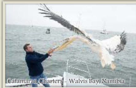
Catamaran Charters - Walvis Bay, Namibia