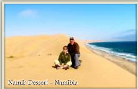
Namib Dessert - Namibia