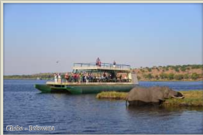
Chobe - Botswana