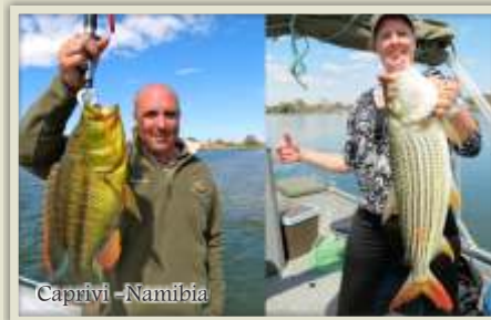
Caprivi - Namibia