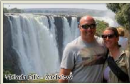
Victoria Falls - Zimbabwe