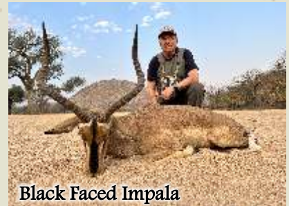
Black Faced Impala