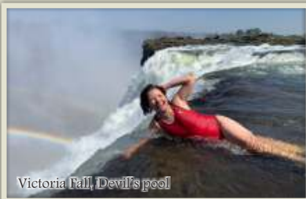
Victoria Falls, Devil's pool