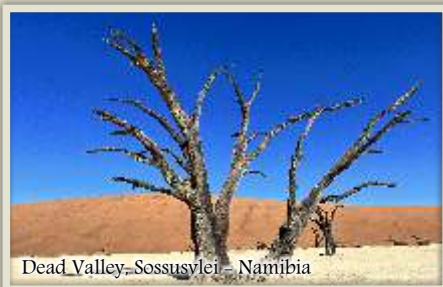
Dead Valley - Sossusvlei - Namibia