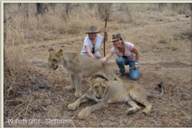
Victoria Falls - Zimbabwe